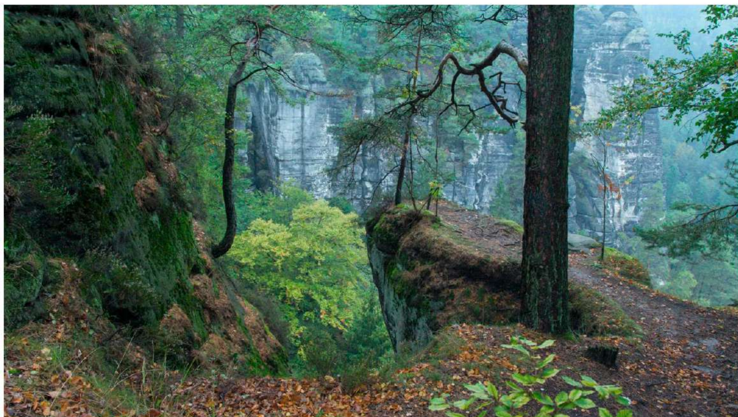
Cyprien Gaillard, still from Retinal Rivalry , 2024. © Cyprien Gaillard. Courtesy the artist, Sprüth Magers and Gladstone Gallery