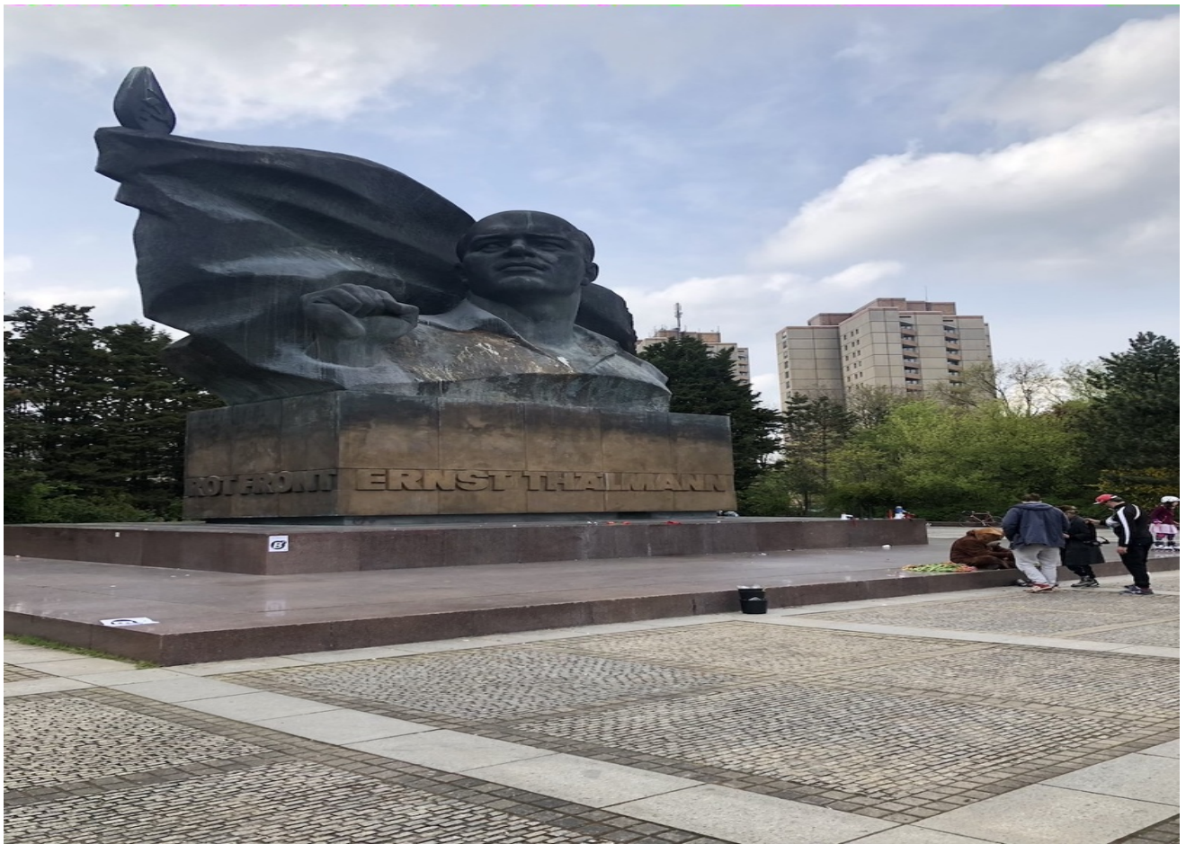
Ernst Thälmann monument.